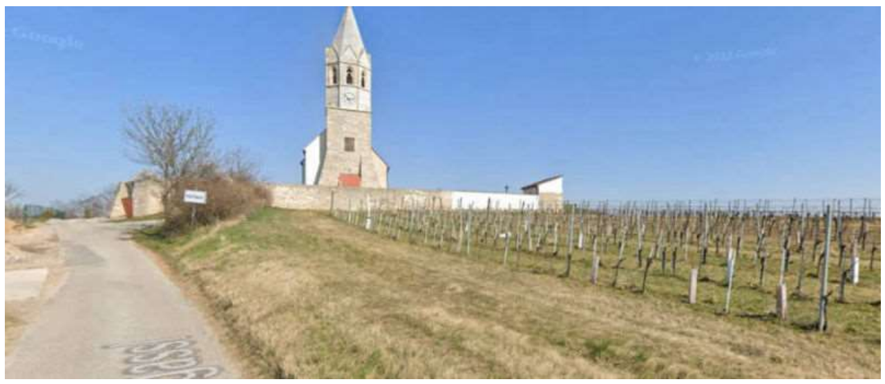
the rear, "sanctuary"

Obviously in practice a lot depends on the way of the village is built, the surrounding terrain up to a point. As for the terrain, villages layouts (would be different elsewhere, but short of the perched, or walled layouts of Southern Europe, the idea is valid) this Austrian gave it a lot of thoughts and has great explanations and material. https://wargamingraft.wordpress.com/?s=1809+terrain